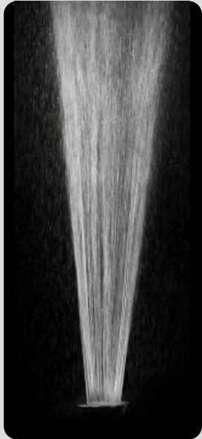
BRISK shower head